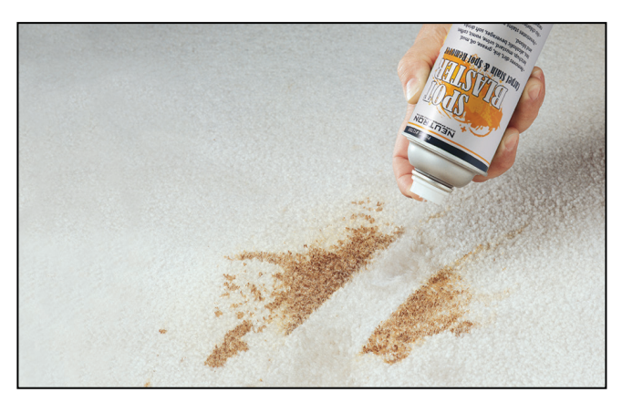
Unique upside down valve let's you spray product while standing up - no bending or stooping.

12 aerosol cans (18oz) per case. Item #127692